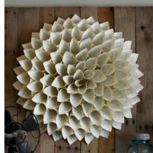
Dahlia book page flower wreath.

January 5 th , 6:30pm Minburn Public Library